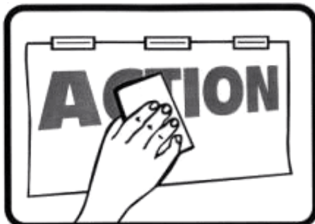
5) After 1 minute (approx.) saturate tape, squeegee once more.

Action Tac is an excellent cleaner and prep agent.