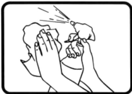
1) Clean surface with Action Tac.

Ideal temperature for applying vinyl is above 40 degrees Fahrenheit.