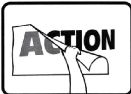
6) Carefully remove transfer tape, pull down at 45 degrees.

A clean surface will usually result in a good transfer.