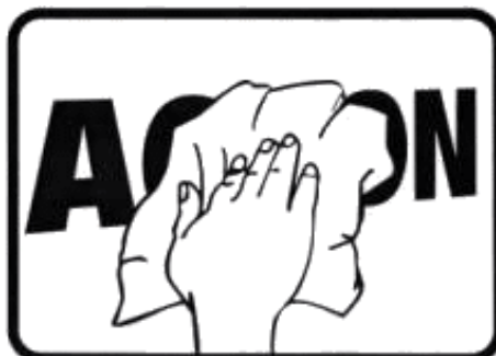
7) Complete transfer by wiping area dry.

A clean surface will usually result in a good transfer.