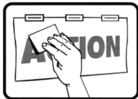
4) Lay and copy wet surface and squeegee down.

Action Tac is an excellent cleaner and prep agent.